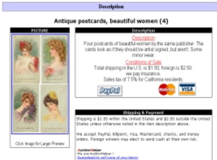
Figure 2. Sample lot descriptions from two of our new sellers, for a matched pair listed in the second experiment. Note that both have the same information available to the buyer, but have different layouts to maintain the impression that they are being listed by different sellers.