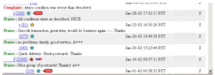
Figure 3. One of the NEW seller's feedback files.