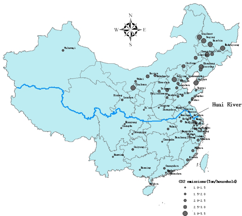
Figure 1: Carbon Dioxide Emissions per Household in 74 Chinese Cities